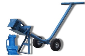
HCP Manual Lift Cart